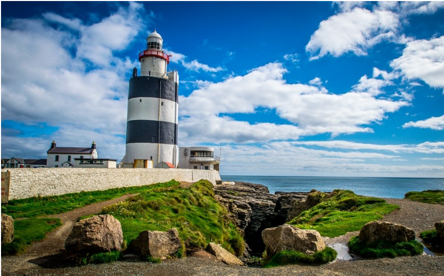
Hook Lighthouse , Hook Head, County Wexford, Ireland

The two main purposes of a Lighthouse are to serve as a navigational aid and to warn ships (Investors) of dangerous areas. It is like a traffic sign on the sea.