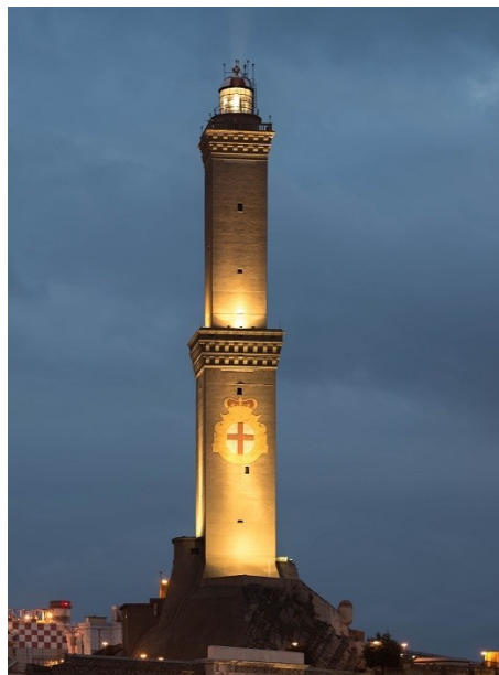
Lighthouse of Genoa , Genoa, Liguria, Italy

Hook Lighthouse (also called Hook Head Lighthouse) is the second oldest continuously operating lighthouse in the world. The lighthouse stands at 115 feet tall, and the original structure was reportedly built in the 12 th century.